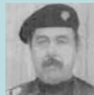
Ali Hasan al-Majid "Chemical Ali"

In addition, ethnic Kurds and Turcomans have been prevented from buying property and those who own property and wish to sell have to find an Arab buyer. Kurds have also been coerced into changing the ethnicity on their identity cards to Arab as part of this process. Turcomans are not even allowed to register as such. They must call themselves either Kurdish or Arab.