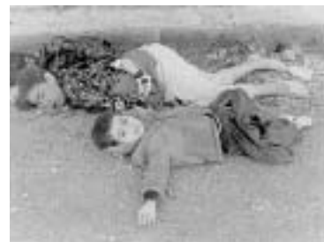
The UN Special Rapporteur reports claims by Kurdish opposition sources that 94,000 individuals have been expelled from their

Persecution of Iraq's Kurds continues today, although the protection provided by the northern No Fly Zone has curbed the worst excesses. Saddam's regime is pursuing a policy of Arabisation in the north of Iraq to dilute Kurdish claims to the oil-rich area around the city of Kirkuk. Kurds and other non-Arabs are forcibly relocated from there to other parts of Iraq.