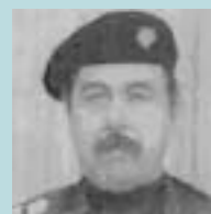
Ali Hasan al-Majid "Chemical Ali"

In addition, ethnic Kurds and Turcomans have been prevented from buying property and those who own property and wish to sell have to find an Arab buyer. Kurds have also been coerced into changing the ethnicity on their identity cards to Arab as part of this process. Turcomans are not even allowed to register as such. They must call themselves either Kurdish or Arab.